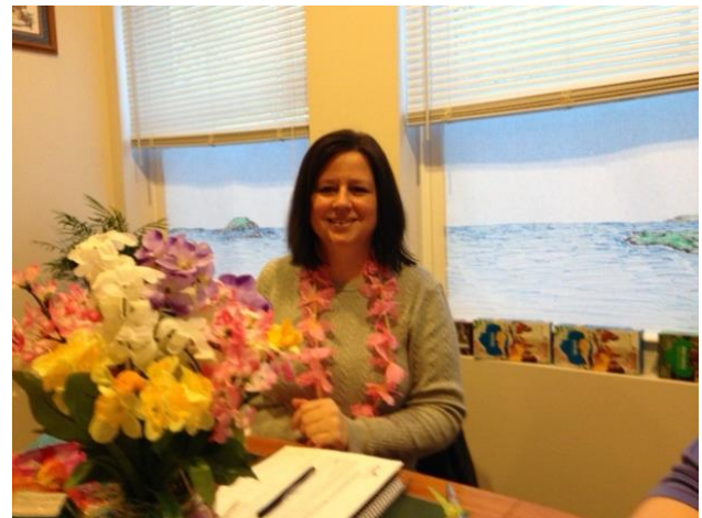
Who says a regional team meeting has to be boring? This SUA is enjoying a reprieve from the winter blahs at this tropical themed meeting.